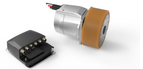
cyber® iTAS® system 2 – the drive system for AGVs from WITTENSTEIN

The WITTENSTEIN group develops, produces and sells gearboxes, motors and electronics, as well as high-precision drive systems and solutions, nanotechnology and specific software solutions.