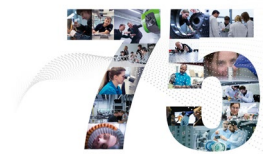
WITTENSTEIN – 75 years in motion

WITTENSTEIN SE develops products, systems and solutions for highly dynamic motion, maximum-precise positioning and smart networking for mechatronic and cybertronic drive technology.