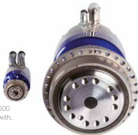
New dimension: TPM+004 and TPM+500 show the high bandwidth.

The result: Genuinely economical products.