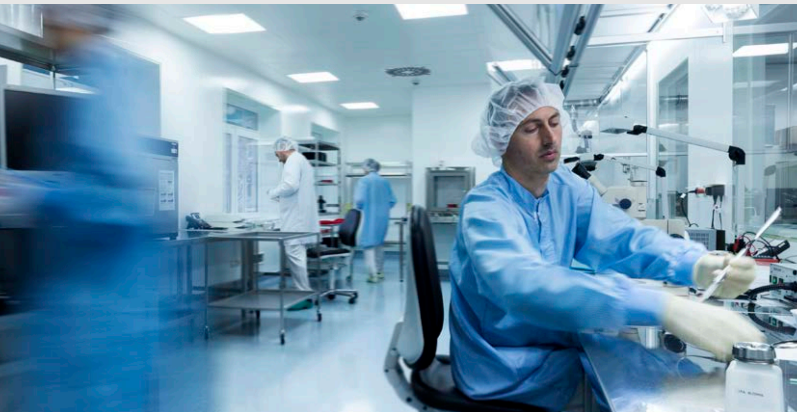
View of the WITTENSTEIN intens cleanroom, where the FITBONE® intramedullary lengthening nail is made.