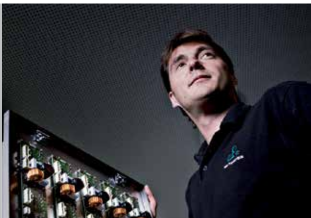
Sensorless drive electronics for efficient machining processes

Our deep knowledge and a rich body of experience combine with creativity and a pioneering spirit as the key to your project's success. Close collaboration between our specialists and yours is an intrinsic part of our philosophy.