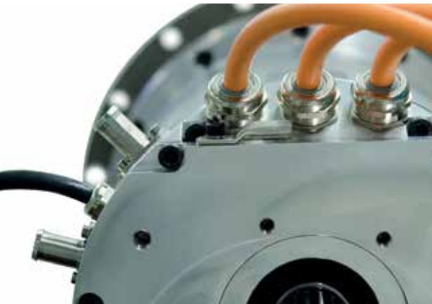
Traction drive for an electric commercial vehicle