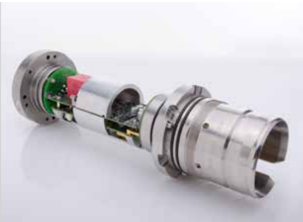
Electronics for subsea valve actuator