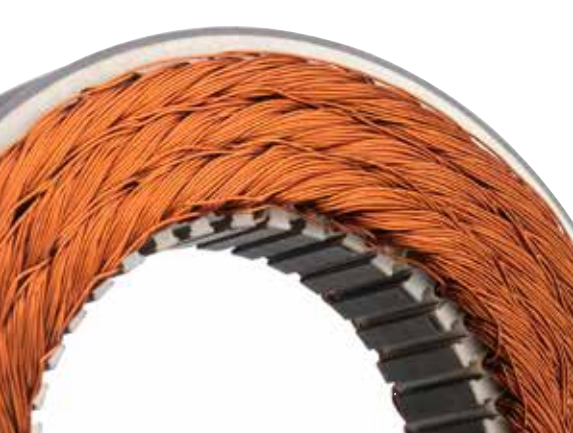
Special stator winding for a synchronous motor